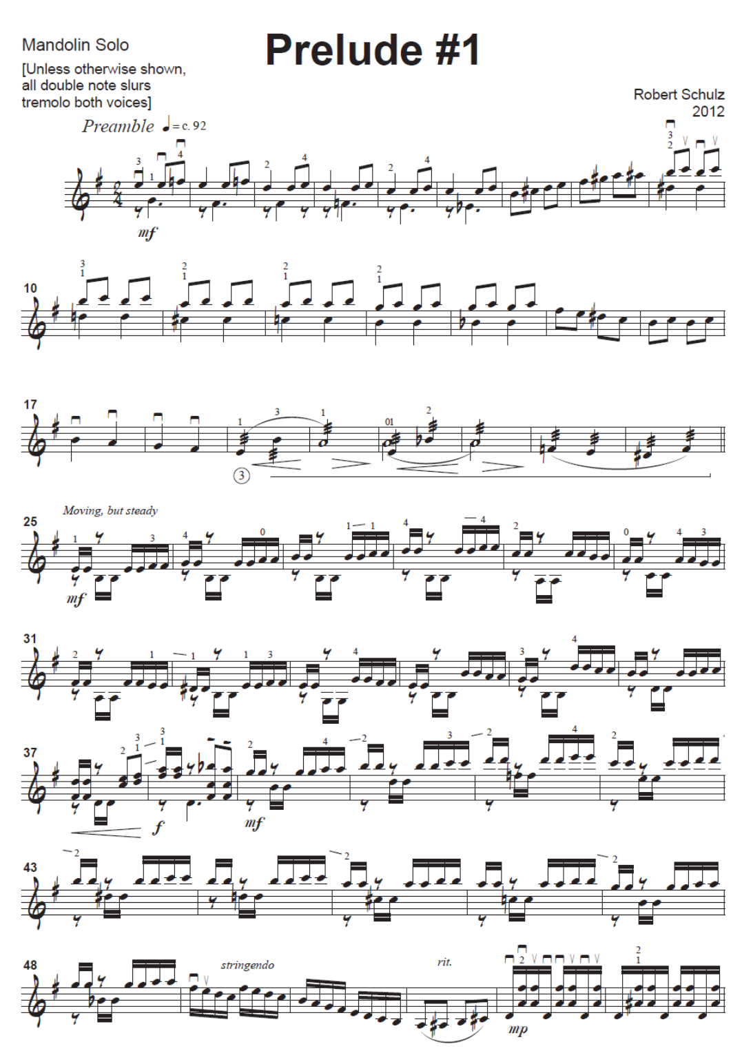
MS 006 'Prelude #1' © Robert Schulz 2012 Page 1